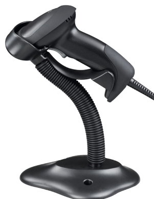
Themis TS-100 in