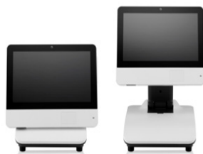
Choice of monitor size, Compact and small foot print

*Specification is subject of change without prior notice