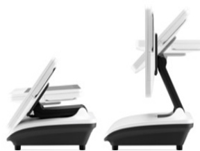
Flexible design allows wide range of usability's in Point of Sale