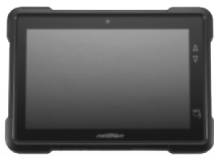
10.1"High brightness monitor with auto rotation function

The Enterprise Tablet provides the highest usability matching various industrial needs. EM-100 is designed for everyday use in the fields of logistics, retail, hospitality and many more. The Enterprise Tablet EM-100 improves profitability and customer satisfaction.