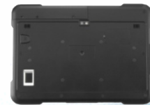
Integrated FingerPrint sensor (optional)