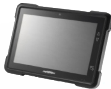
Integrated NFC reader (optional)